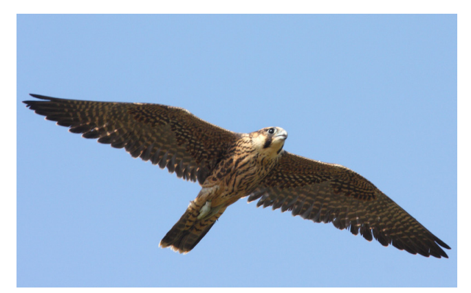
Juvenile peregrine falcon

Minn. In the spring of 1985, the first five young captive bred peregrines were brought to Minnesota for release.