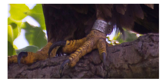
Leg band of the Gedney pickle eagle.

Between 2003 and 2012, that eagle had produced an estimated 20 eaglets, a major contribution to a species recovering from the threat of its extinction.