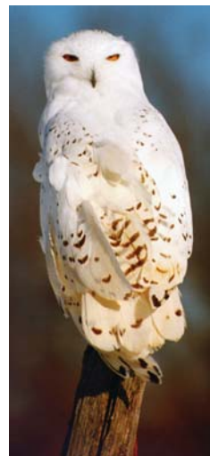
The snowy owl moves south from the Arctic to the Great Plains in the winter months.

Rough-legged hawks breed along cliff faces in the tundra and taiga of the arctic, but winter in southern Canada and northern and central North America. These raptors have a large degree of variation in plumage, from very light to almost chocolate brown. The hawk’s name describes its feather pattern, which extends to the tops of its small feet. The rough-legged hawk’s wings and tail are relatively long, and well-suited for hovering over open fields as it looks for small rodents.