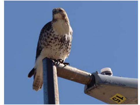
A red-tailed hawk perches on a light pole.

Some estimates put the remaining native tall- and short-grass prairies of North America at 1-2 percent of their original land space. Two owl species in Minnesota have received state status: short-eared owls are of special concern, and burrowing owls are endangered in Minnesota. The conversion of formerly open habitats to agricultural lands, pastures for cattle grazing, and housing and recreational developments is the key factor in recorded declines for the short-eared owl, according to the Cornell Lab of Ornithology.