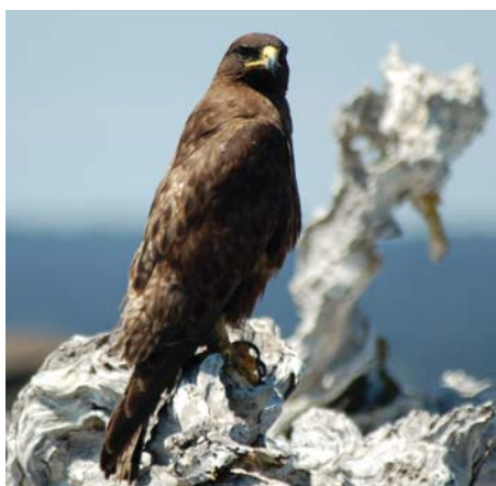
A Galapagos hawk on Santiago Island