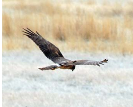
A harrier courses through a field.

When they hunt, they slowly fly—quartering or coursing back and forth across an open area with their head (and ears) pointed downward, listening for an