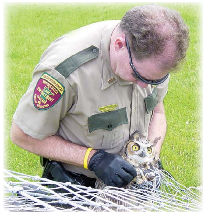
A conservation officer rescues a great horned owl from a soccer net for transport to The Raptor Center.