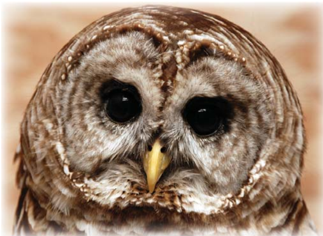
This young barred owl, whose eyesight is permanently impaired, is the newest member of The Raptor Center's education team.